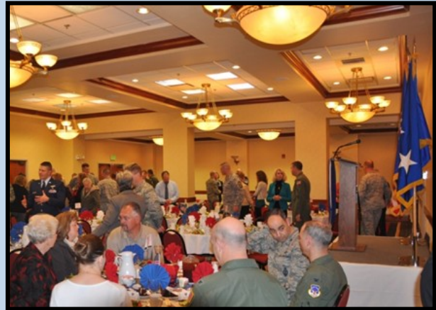
The Plains Hotel was bursting at its seams, with leaders from the community and the various military branches in attendance.