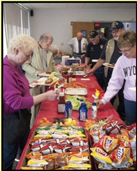
Retiree appreciation day attendees help themselves to hamburgers, hot dogs and fixings in the 90th Medical Group clinic, F. E. Warren Air Force Base, May 4.