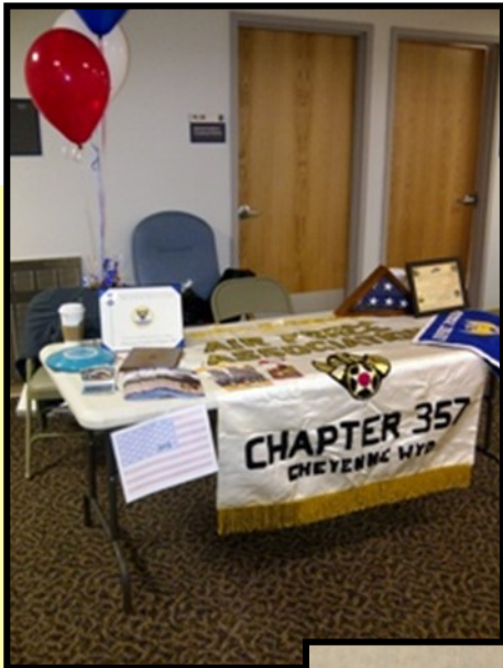
In support of our many local retired servicemen and women, AFA sponsored a table at the Retiree Appreciation Day held May 4, 2013, at the FE Warren 90th Medical Group Base Clinic .