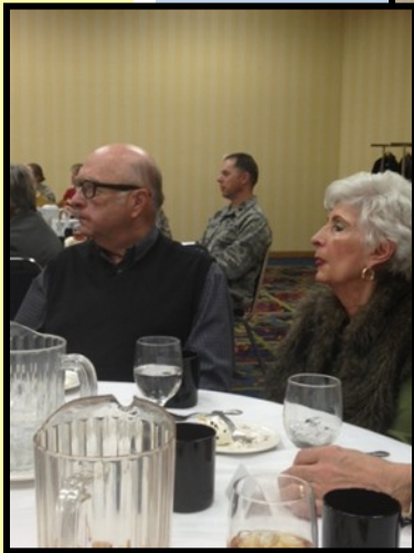
Just a few of our WONDERFUL Community Partner representatives and military leaders enjoying the program.